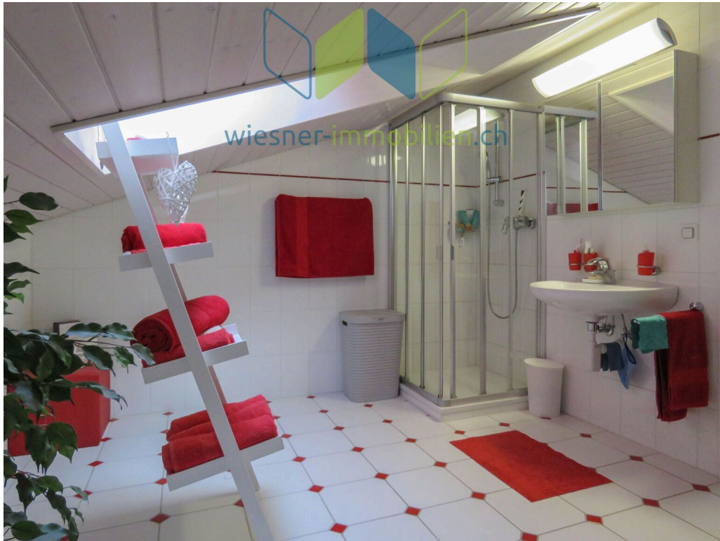
DU / WC