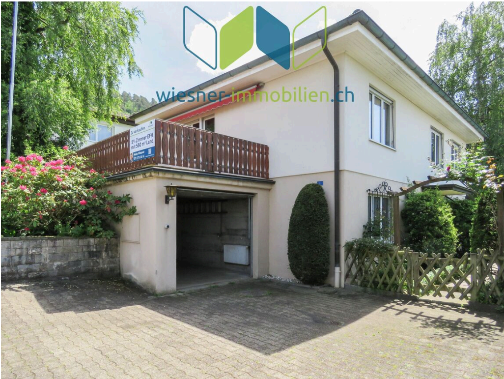
Eingangsbereich und Garage