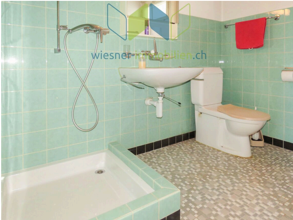
Waschraum / Dusche / WC